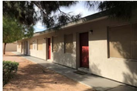
NORTH LAS VEGAS