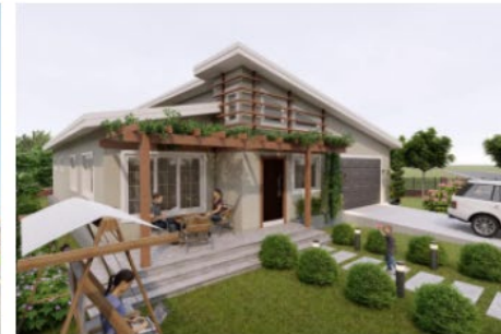
NORTH STREET – COMING 2022