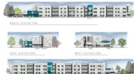
EASTERN SENIOR HOUSING – COMING 2023