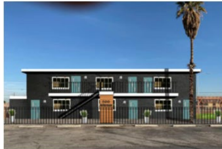
HISTORIC WEST SIDE