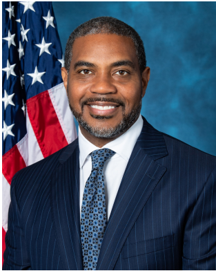
Steven Horsford Congressman for Nevada