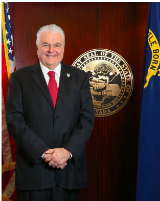
Steve Sisolak Governor of Nevada