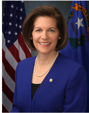
Catherine Cortez Masto United States Senator for Nevada