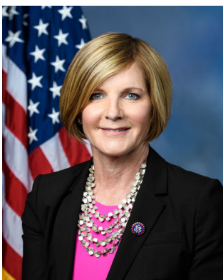
Susie Lee Congresswoman for Nevada